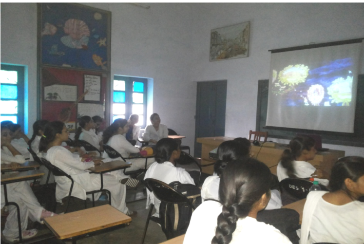
Learning through Films