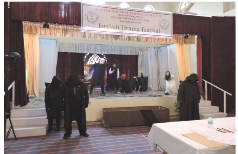
Stagecraft and Theatre Techniques