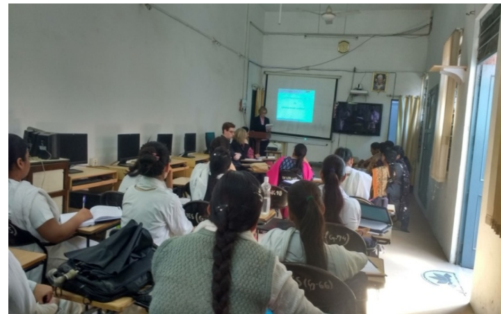
DEI-Kiel Faculty-student Exchange Programme, 2015