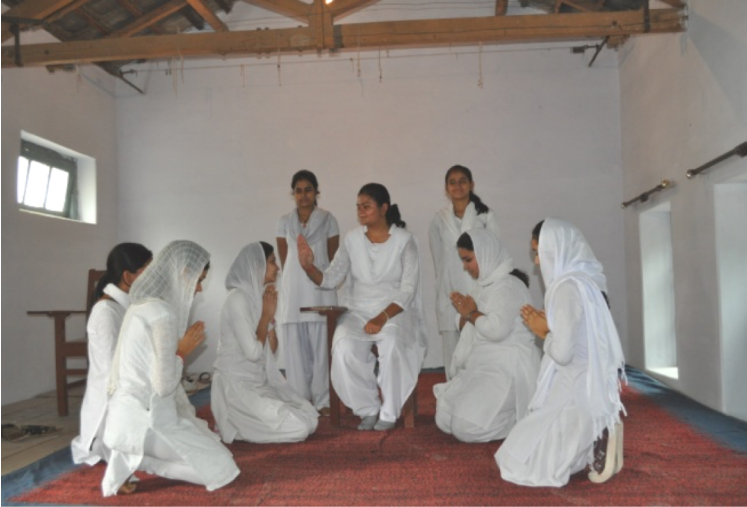
Learning through Dramatics