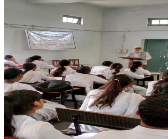
Workshop on Theatre Techniques, 2015