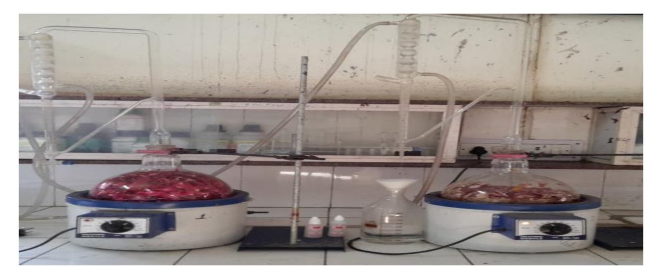
Glimpses B.Sc. Applied Botany Sciences (Honours)