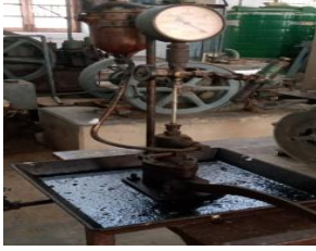
Injector Testing Equipment