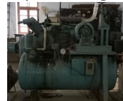
2- Stage Reciprocating Compressor