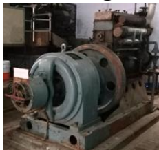
Skoda Diesel Engine (90 HP)