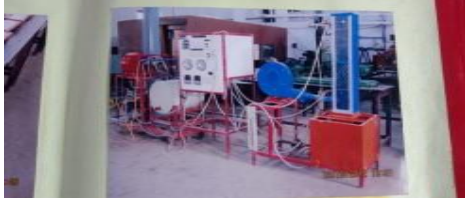
Mini Steam Power Plant (Test Rig)