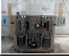
Air and Water Heat Pump Test Rig