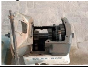
Sliding Mesh Gear Box