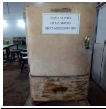
Open Unit Domestic Refrigerator