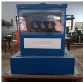
Model Of Jet Condenser