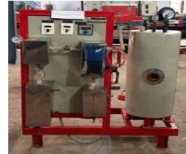
Separating And Throttling Calorimeter