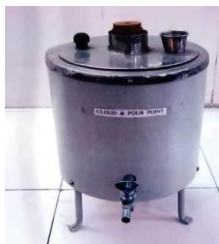
Cloud And Pour Point Apparatus