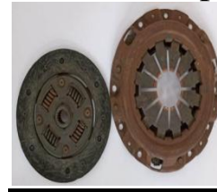
Single Plate Clutch (Diaphragm type)