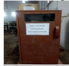
Sealed Unit Domestic Refrigerator