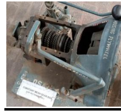
Constant Mesh Gear Box