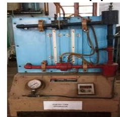
Vortex Tube Apparatus