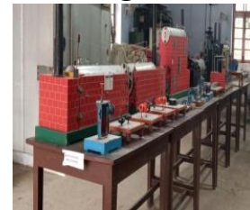
Boilers, mountings and accessories