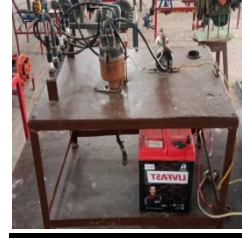
Battery/Coil Ignition System