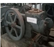
Kubota Petrol Engine