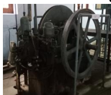
Ruston Diesel Engine