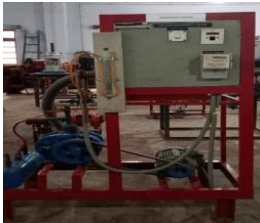
Rotary Compressor (Test Rig)