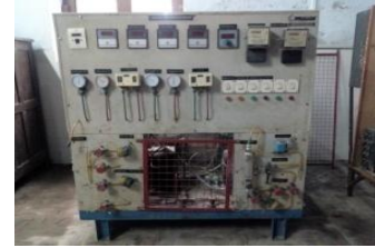
Cascade Refrigeration Test Rig