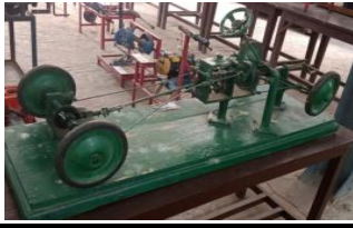
Model of Chassis