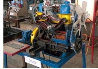
Petrol Engine (Cut Section Model)