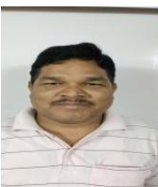
Shri Virendra Kumar