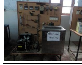
Ice Plant Test Rig