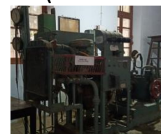
Morse Test (Fiat Petrol Engine)