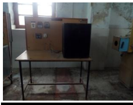
Vapour Absorption Refrigeration System