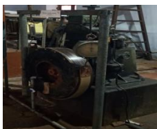
Skoda Diesel Engine (10 HP)