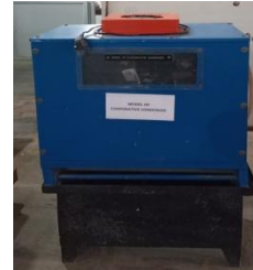
Model Of Evaporative Condenser