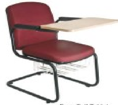
Ergo Full Tablet

Representative Photo/Sketch mentioned below.