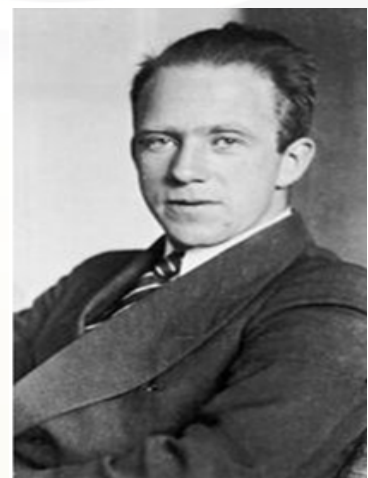
-Werner Heisenberg Nobel Laureate

"In the history of science, ever since the famous trial of Galileo, it has repeatedly been claimed that scientific truth cannot be reconciled with the religious interpretation of the world. Although I am now convinced that scientific truth is unassailable in its own field, I have never found it possible to dismiss the content of religious thinking as simply part of an outmoded phase in the consciousness of mankind, a part we shall have to give up from now on, Thus in the course of my life I have repeatedly been compelled to ponder on the relationship of these two regions of thought, for I have never been able to doubt the reality of that to which they point."