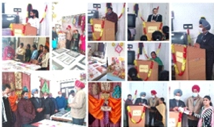
Founder's Day Celebration at DEI Study Center, Jalandhar