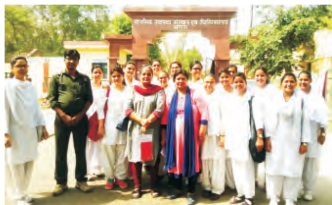
Members of the Training group at Institute of Mental Health & Hospital, Agra.

The Department of Psychology organized Practical Training in Diagnosis and therapeutics in Clinical Psychology at the Institute of Mental Health and Hospital (IMH&H) for the Ph.D. scholars, students of M. Phil., M.A. (S.Sc.) and B.A. (S.Sc.) Honours from 1 st June to 30 th June, 2018. The timings were from 9 am to 4 pm, where students were expected to perform duties till 2 pm and then attend classes related to Psychiatry and Clinical Psychology. They were frequently monitored and supervised during the visits by the Faculty members. The