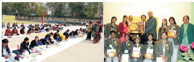
School Students of Agra participating in the Drawing Competition

173 students from 27 different schools of Agra participated in the Drawing Competition and 164 students from 16 different schools participated in the Essay Competition.