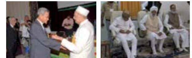
Glimpses of SPIRCON 2010 and Conclave

I n the year long celebrations of the Sesquicentennial year of Satsang, the organization of the International Seminar on Religion of Saints (Sants) Radhasoami Faith - Spiritual Consciousness Studies (SPIRCON 2010) and the Conclave of Leaders of different traditions of Radhasoami Faith on November 12-14, 2010 has great significance. One of the special achievements of the Seminar was the consensus arrived at among the intellectuals from different countries and leaders of different traditions of Radhasoami Faith (like Dayalbagh, Pipal Mandi (Agra), Taran Taran, Dinod (Bhiwani) that the Radhasoami Faith has the potentialities of emerging as the Post Modern Global Religion with no dissidence or disharmony with other religions.