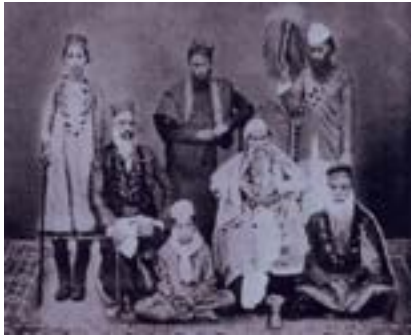
Huzur Soamiji Maharaj with his family members (Huzur Maharaj is standing with a 'chanwar')

P aram Purush Puran Dhani Huzur Soamiji Maharaj (Shiv Dayal Singh Sahab) was born on the night of Monday, the 24th August, 1818 in Panni Gali (one of the narrowest streets of Agra). He was the Incarnation of the Supreme Being and had descended from the Highest Spiritual Region and had assumed Human Form at will. He never needed nor He had any Guru. Whosoever came in contact with Him was at once impressed by His extraordinary spirituality and saintliness.