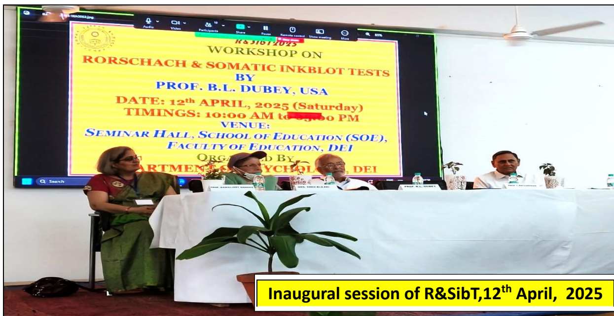
Inaugural session of R&SibT, 12 th April, 2025