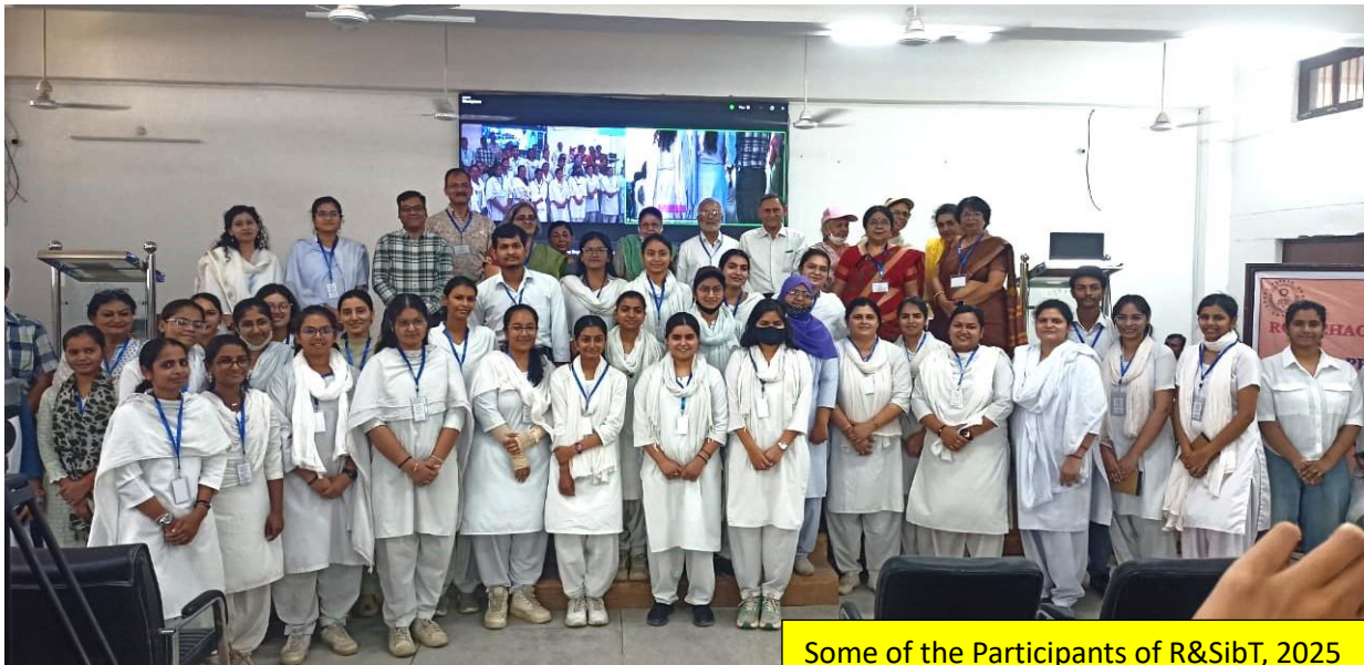
Some of the Participants of R&SibT, 2025

The objectives of the workshop were: (1) To enable the students studying Psychology and Cognitive Science as their major course as well as research scholars, practitioners and educators gain an understanding of projective techniques and their applications. (2) To give clarity of information and gain experience for the conduction of psychological testing of projective technique online, specifically Somatic Imagery test(SIT) that is an online version of conduction of a projective technique and interpretation of responses even using AI programming as an option. (3) Learning to interpret the responses and assess the personality of individuals accordingly. (4) To make the students aware of the use and application of SIT in counselling and other fields like in Organisations for employees, Career counselling, Family Counselling, Relationship issues in marriage counselling etc. for all across different age groups. Fifty-one participants (mainly students) participated in offline mode and fourteen participants were present online.