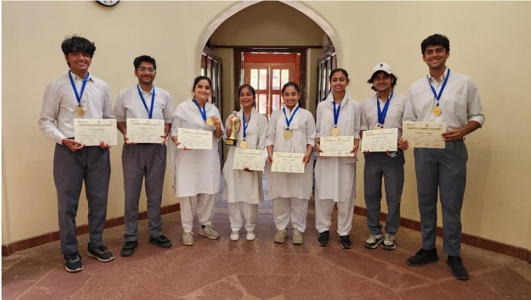
TEAM GROUP SONG WESTERN