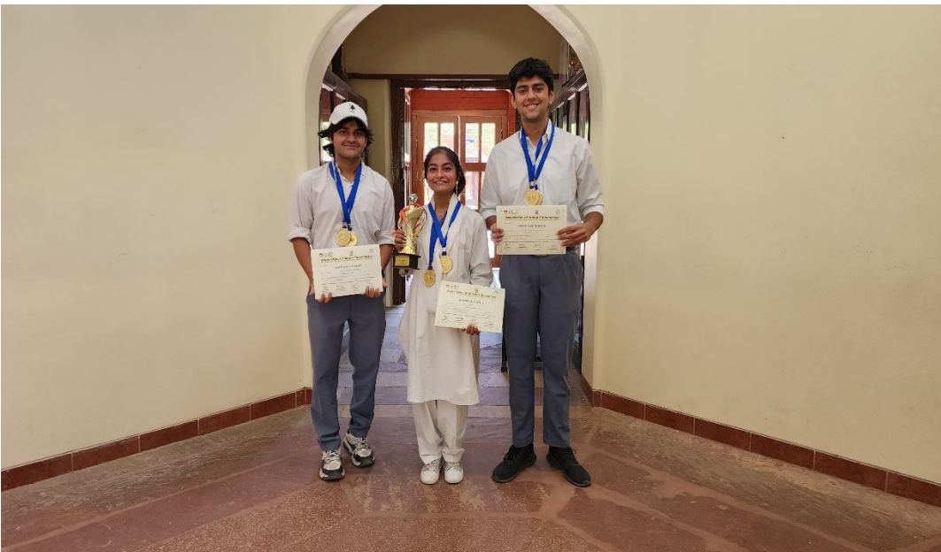
TEAM WESTERN VOCAL SOLO