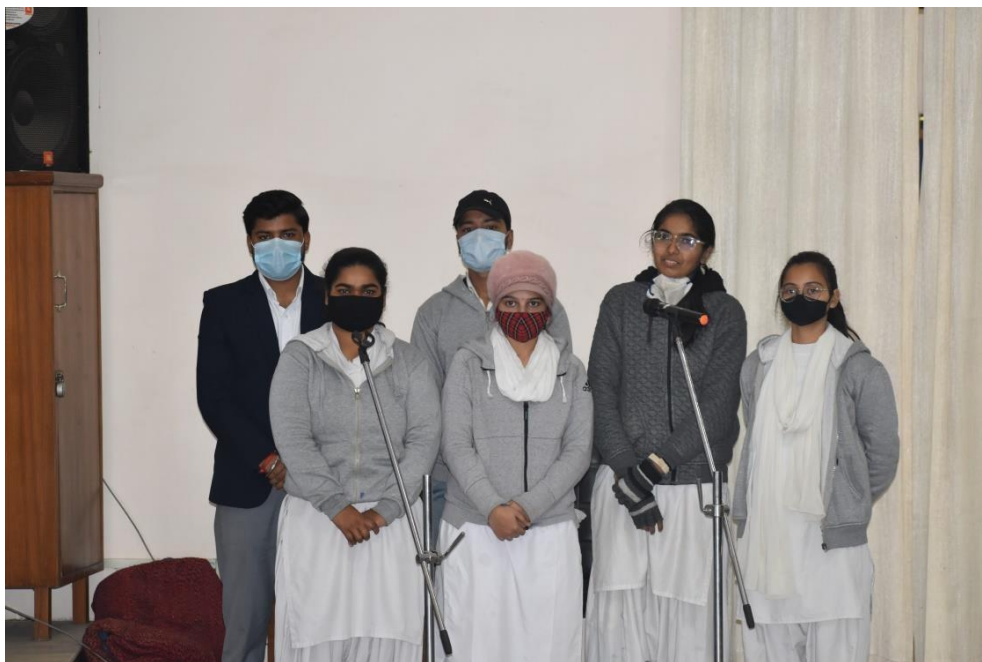
University Prayer sang by students