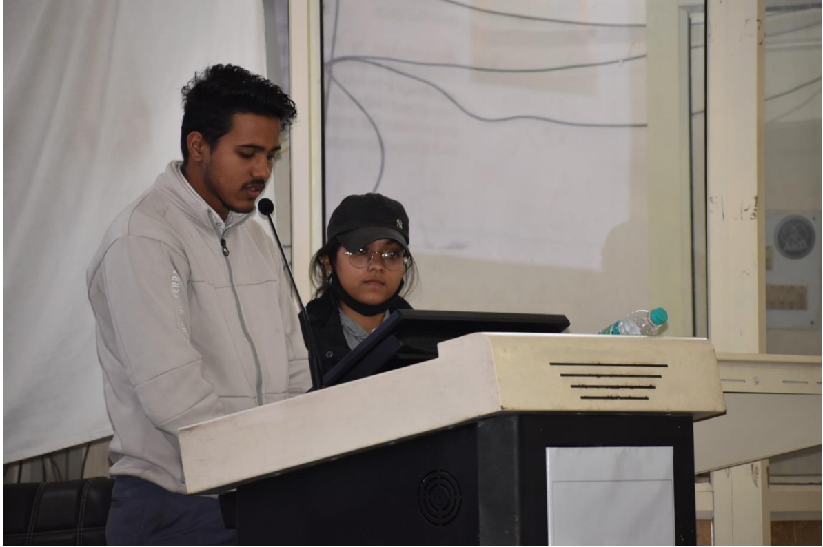
Anchoring by B.Tech. students