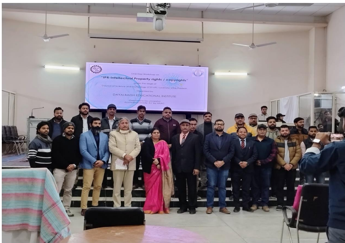
Faculty members along with distinguished speakers