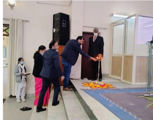
Lighting of the lamp